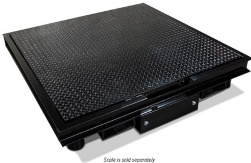
Scale is sold separately